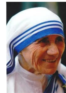
St. Mother Teresa of Calcutta