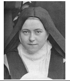
St. Therese of Lisieux