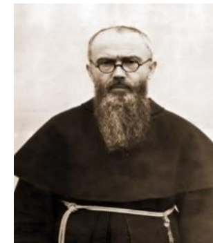
St. Maximillian Kolbe

Respect for the human person proceeds by way of respect for the principle that "everyone should look upon his neighbour (without any exception) as 'another self,' above all bearing in mind his life and the means necessary for living it with dignity." CCC 1931