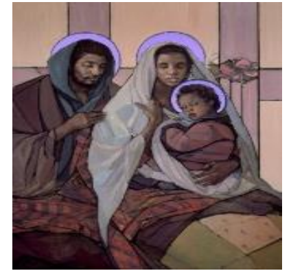
The Holy Family