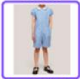
Blue and white check playsuit