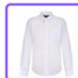
White shirt - no over sized collar