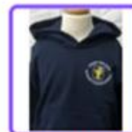
PE Hoodie with or without the logo