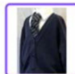
Navy cardigan or navy jumper

Our uniform shows that we are part of the Christ the King Catholic Primary School community. We have the highest expectations from our pupils with regards to school uniform and appearance, and strongly believe that our high standards promote positive behaviour, support effective teaching and learning and contribute to the ethos of the school.