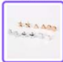
Stud earrings to be worn all year - not hoops