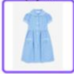
Blue and white check dress