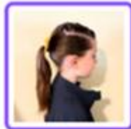
hair must be tied back - no patterns cut into hair