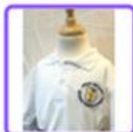
White Polo shirt with or without school logo

Our uniform shows that we are part of the Christ the King Catholic Primary School community. We have the highest expectations from our pupils with regards to school uniform and appearance, and strongly believe that our high standards promote positive behaviour, support effective teaching and learning and contribute to the ethos of the school.