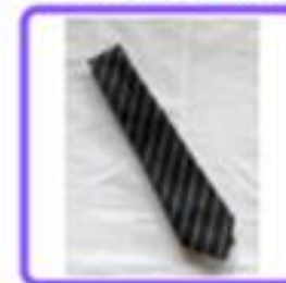
CTK school tie