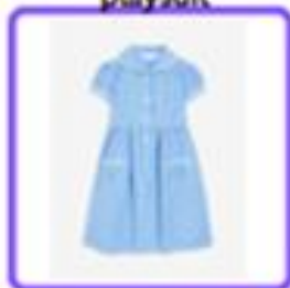
Blue and white check dress