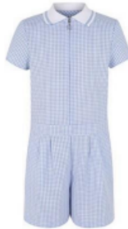
Playsuit for girls which has an all over checked pattern.