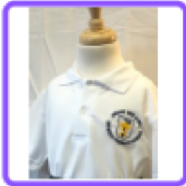
White Polo shirt with or without school logo

Our uniform shows that we are part of the Christ the King Catholic Primary School community. We have the highest expectations from our pupils with regards to school uniform and appearance, and strongly believe that our high standards promote positive behaviour, support effective teaching and learning and contribute to the ethos of the school.