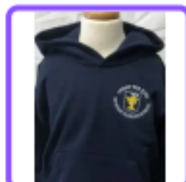
PE Hoodie with or without the logo