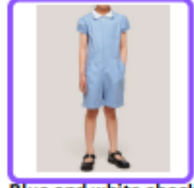
Blue and white check playsuit