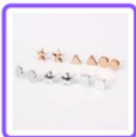
Stud earrings to be worn all year - not hoops