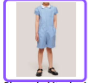
Blue and white check playsuit