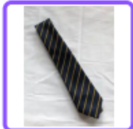
CTK school tie