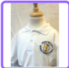
White Polo shirt with or without school logo

Our uniform shows that we are part of the Christ the King Catholic Primary School community. We have the highest expectations from our pupils with regards to school uniform and appearance, and strongly believe that our high standards promote positive behaviour, support effective teaching and learning and contribute to the ethos of the school.