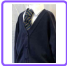
Navy cardigan or navy jumper

Our uniform shows that we are part of the Christ the King Catholic Primary School community. We have the highest expectations from our pupils with regards to school uniform and appearance, and strongly believe that our high standards promote positive behaviour, support effective teaching and learning and contribute to the ethos of the school.