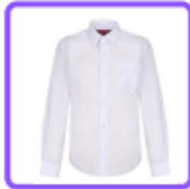
White shirt - no oversized collar