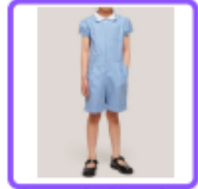
Blue and white check playsuit