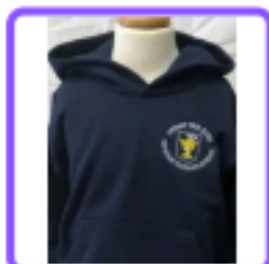
PE Hoodie with or without the logo