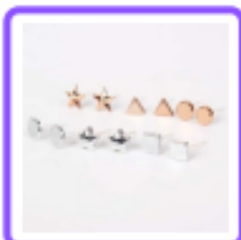
Stud earrings to be worn all year - not hoops