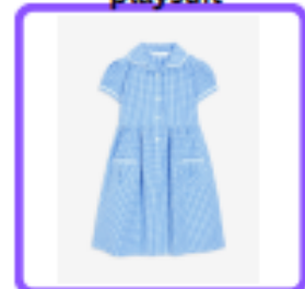
Blue and white check dress